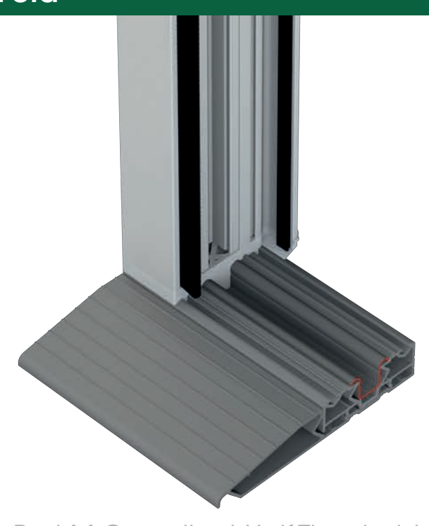
Part M Compliant Half Threshold 27mm high