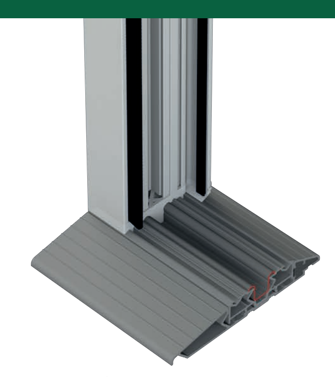
Part M Compliant Low Threshold 27mm high