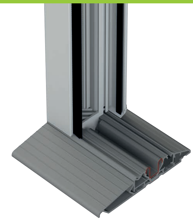
Part M Compliant Low Threshold (Thermally Broken) 26.5mm high