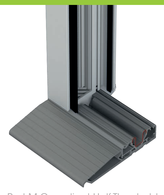
Part M Compliant Half Threshold (Thermally Broken) 26.5mm high