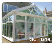
GC - G16