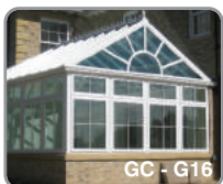
GC - G16

One of our most popular designs and comes in a variety of styles and spoke variations from between 3 and 7 spokes. As its name suggests it portrays the sun halfway over the horizon with its bars radiating from the curved transom. The design pictured to the right is GC-G16 .