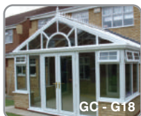
GC - G18